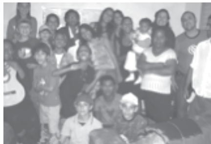
Reaching out to the beloved Brazilian brethren